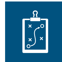
Sites NOW Playbook for Site Success