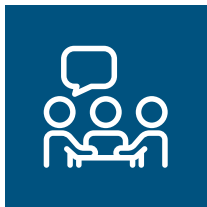
Monthly Sites Now Meeting