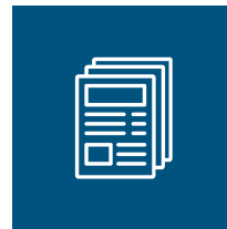
Monthly article in SCRS Newsletter