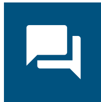
Quarterly Sites NOW Forum